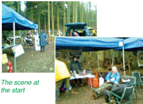
The scene at the start

Section 1 had been designed to ease the riders into the conditions, and despite the exposed roots in the hollow with trees to negotiate, it did not seem to offer too great a technical challenge – most riders managed to stay clean.