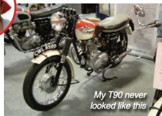
My T90 never looked like this