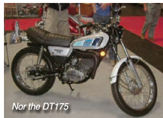
Nor the DT175