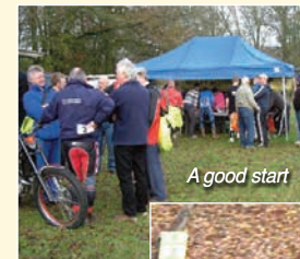
A good start

The ground at Kingsfold was as dry as I can remember seeing it, though inevitably it soon became very slippery as water was dragged out of the stream. Also the stream level was comparatively very low in most places. A good entry of 90 riders (over 20 on the day) and a course of 10 sections ridden 4 times.