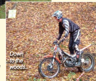
Down to the woods...

challenge increased as the day went on and the gentle slope out of the stream