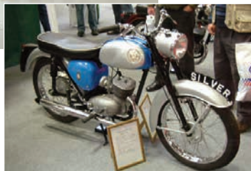
A few more on the back page...